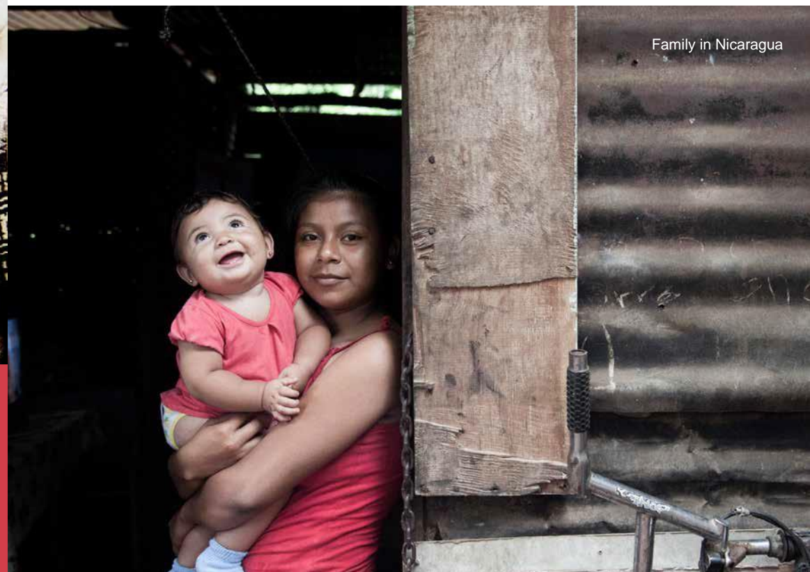
Family in Nicaragua

Life is a daily struggle for many children and families in NPH countries. To survive, they must overcome the dangers and hardships that bring an enormous amount of stress into their daily lives. As a result, some turn to drug and alcohol use, gangs, crime or violence as a means of survival. Sadly, those paths are often the most destructive, destroying opportunities and lives in the process.