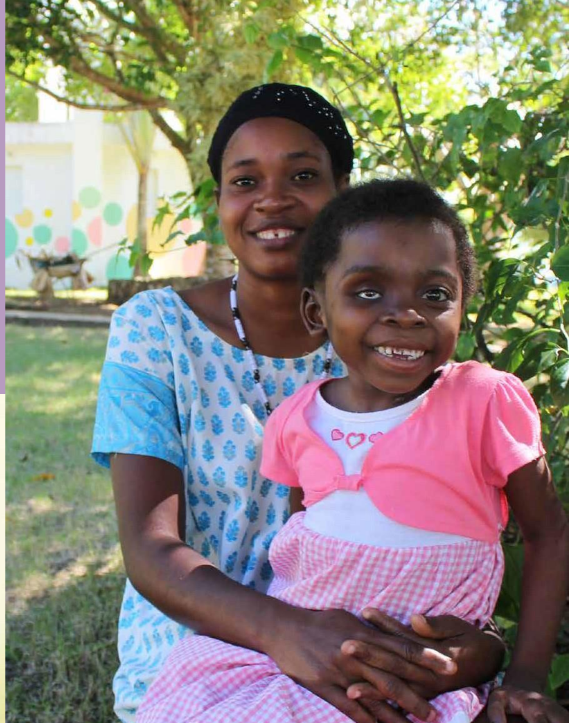
Oncology patient and her caregiver at NPH Dominican Republic home.