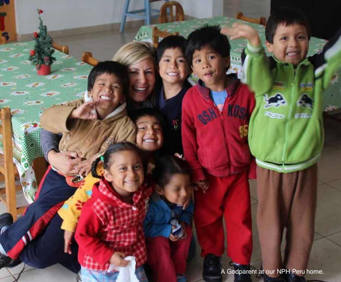
A Godparent at our NPH Peru home.