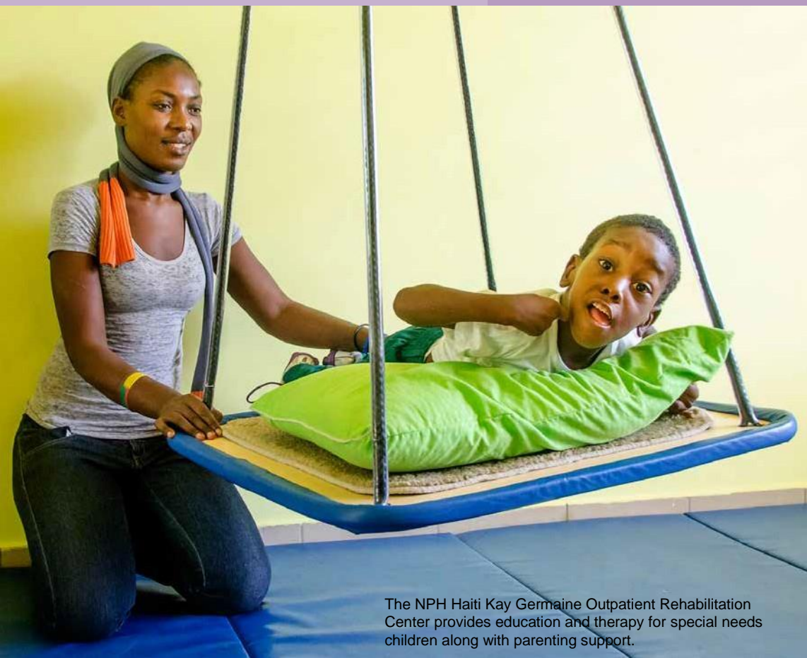
The NPH Haiti Kay Germaine Outpatient Rehabilitation Center provides education and therapy for special needs children along with parenting support.

Since radiation therapy is not available in Haiti, NPH's St. Damien Pediatric Hospital partners with our Dominican Republic home to offer room, board, care and transportation to Haitian pediatric oncology patients. After receiving therapy in the capital, Santo Domingo, patients return to Haiti for continued care at St. Damien.